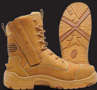
WHEAT - K27997