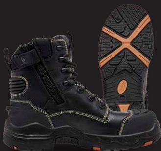
BLACK - K28002