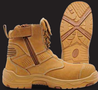
WHEAT - K28009