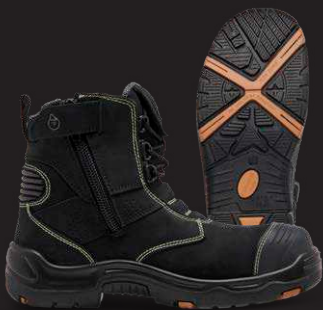
BLACK - K28008