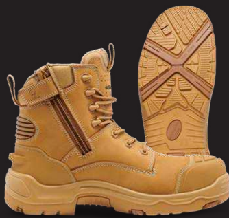
WHEAT - K27999