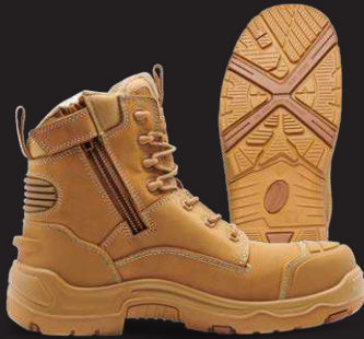
WHEAT - K28001