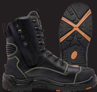
BLACK - K27996