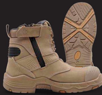
STONE - K28013 AU/US 4-11 (HALF SIZES 5.5-10.5)