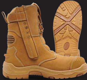
WHEAT - K28007