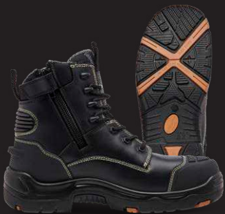
BLACK - K28000