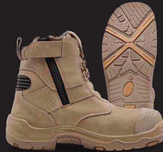
STONE - K28010