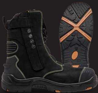
BLACK - K28006