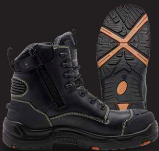
BLACK - K27998