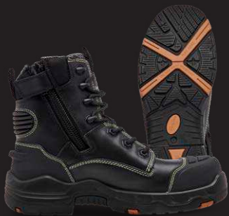
BLACK - K28004