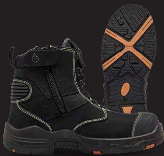
BLACK - K28011 AU/US 4-11 (HALF SIZES 5.5-10.5)