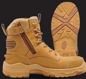
WHEAT - K28003