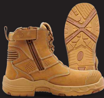
WHEAT - K28012 AU/US 4-11 (HALF SIZES 5.5-10.5)