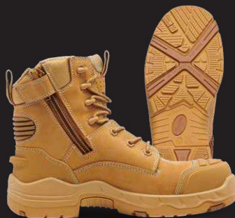
WHEAT - K28005